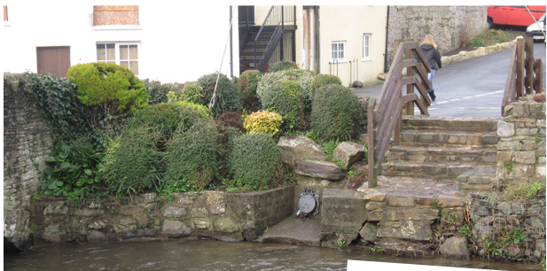
Score Farm Bridge