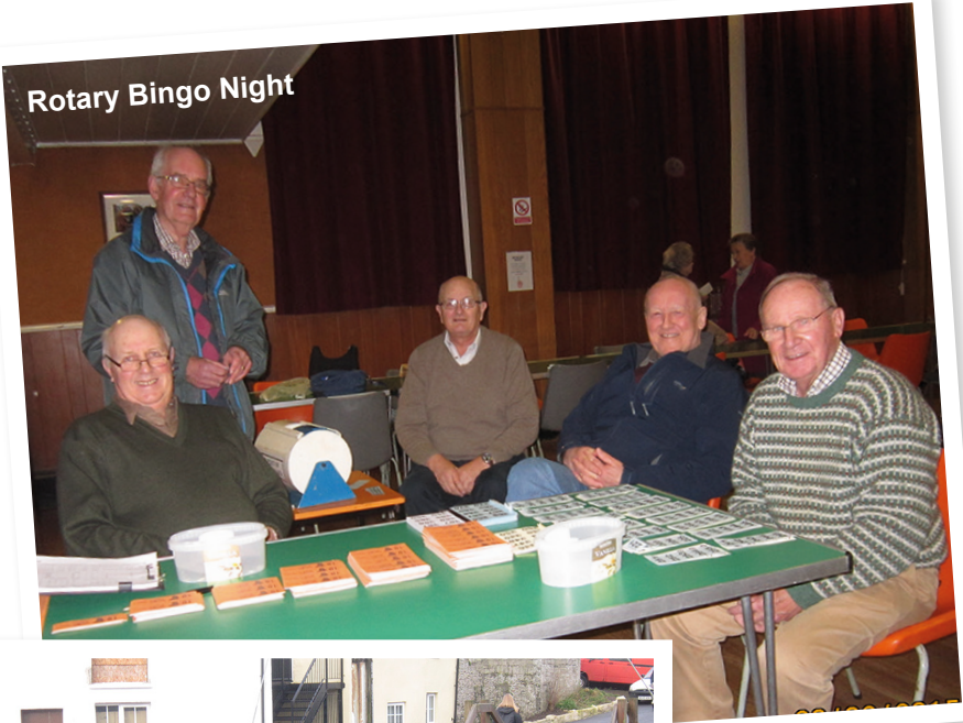
Rotary Bingo Night