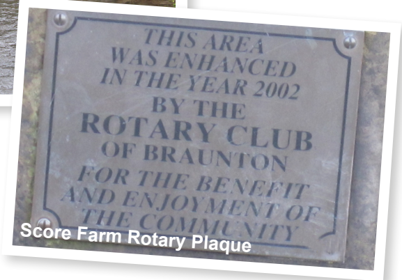
Score Farm Rotary Plaque