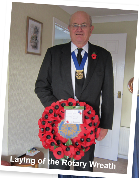
Laying of the Rotary Wreath