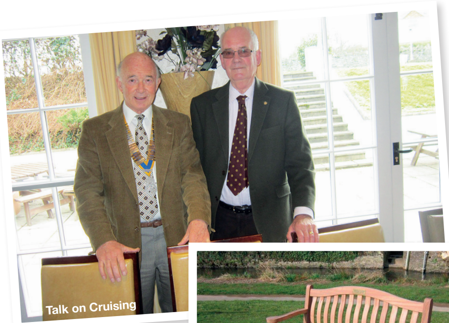
Talk on Cruising