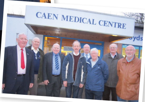
CAEN MEDICAL CENTRE